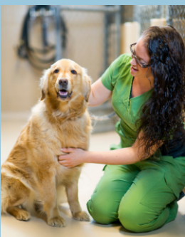
Helping pets & their guardians