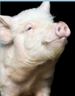
Action continues for farmed animals