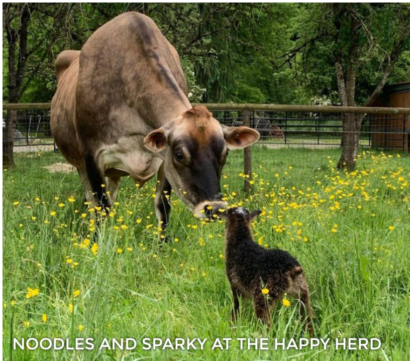
NOODLES AND SPARKY AT THE HAPPY HERD

Thank you to everyone in the community who shared about the event, purchased a plant-based pizza from Panago on November 28th, or gave a gift to help animals.