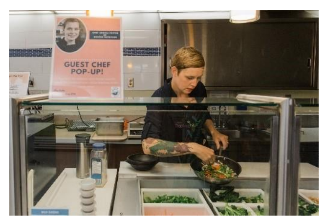
Photo: In May, 2019 we held a culinary workshop and guest chef pop up at the BC Women's and Children's Hospital.

Plant-Based Plates aims to expand the plantbased offerings on food service menus. This program offers resources such as recipes, sampling, presentations and culinary support to institutions such as schools, businesses and healthcare providers.