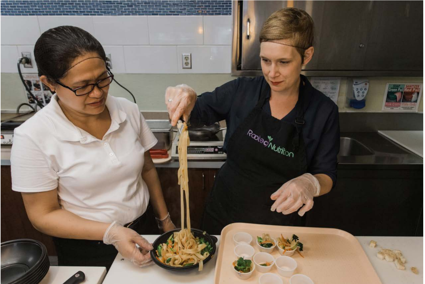
VHS organized staff culinary training and a guest chef pop-up and training at Children's & Women's Hospital.