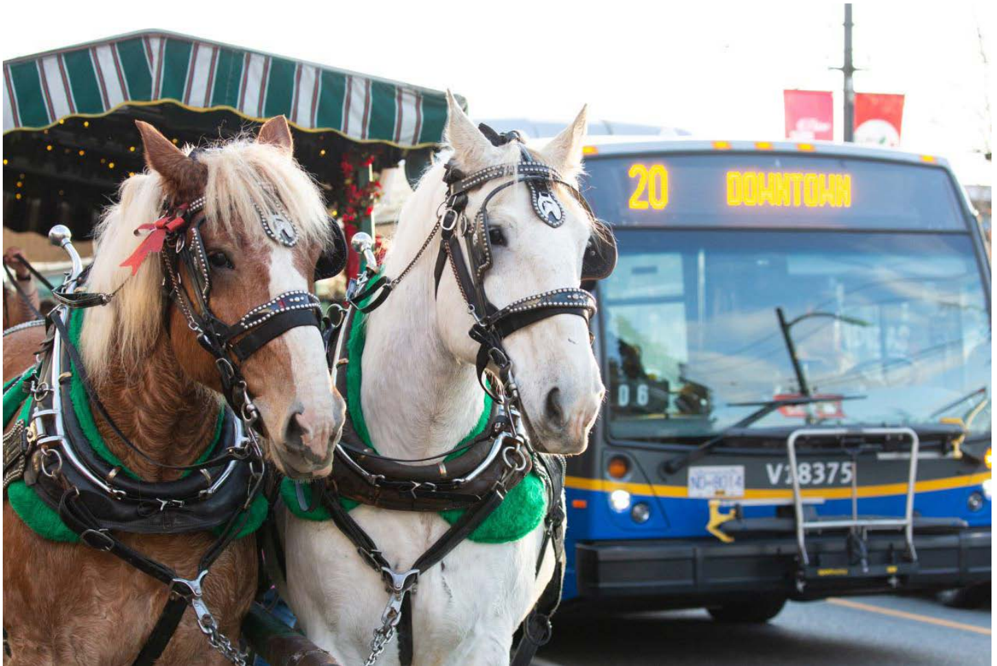
VHS is concerned about the use of carriage horses in urban areas.