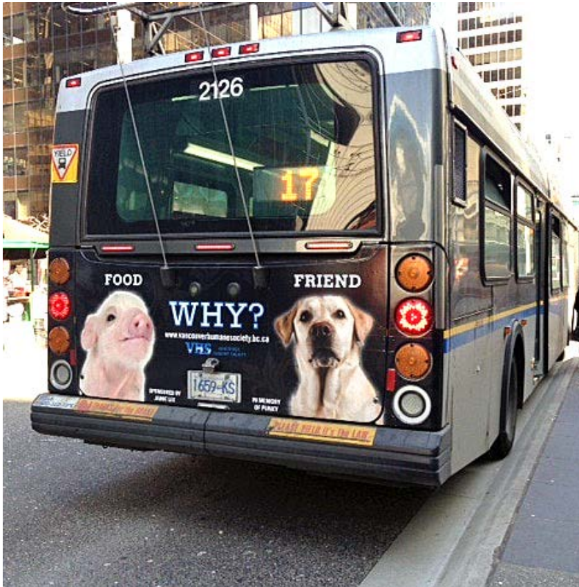
Our trolley bus ad campaign attracted attention across Vancouver