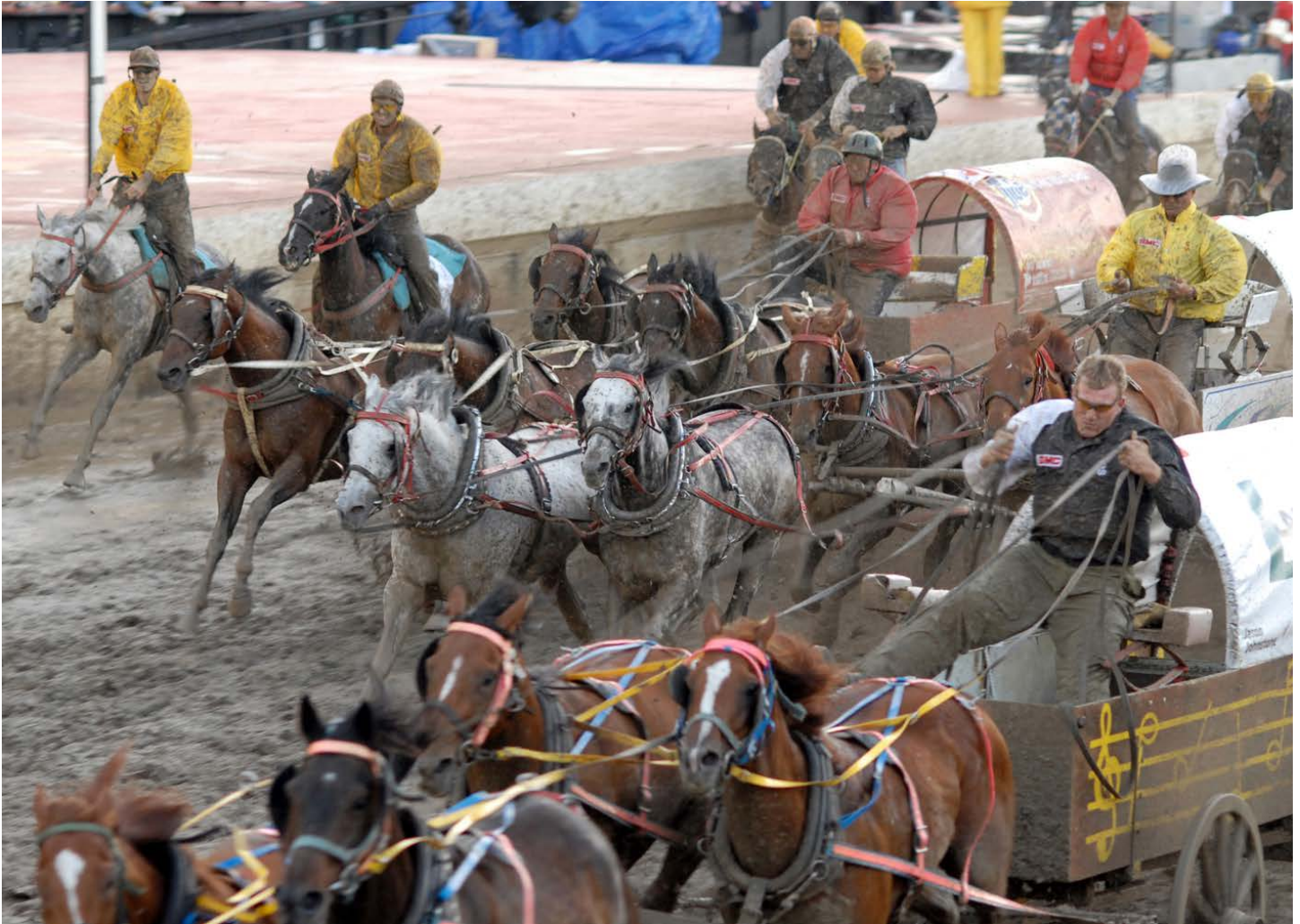
The Calgary Stampede chuckwagon race.